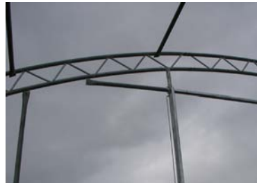
Pre-Drilled, Bolt together frame