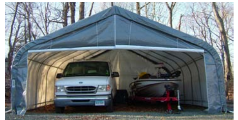
Two Car Garages