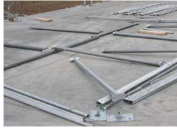
All frame members are long life galvanized steel