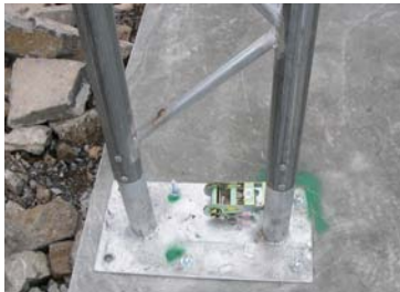
Side Tensioning Cover Ratchet