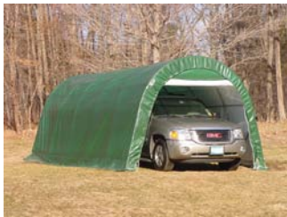
One Car Garages