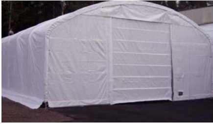
Easy Roll-Up Mechanical Door On Each End