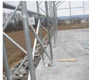
Heavy-Duty Base Plates