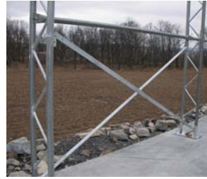
Structural wind brace on each corner