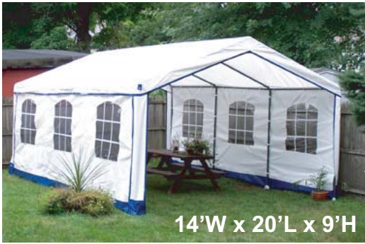
14'W x 20'L x 9'H