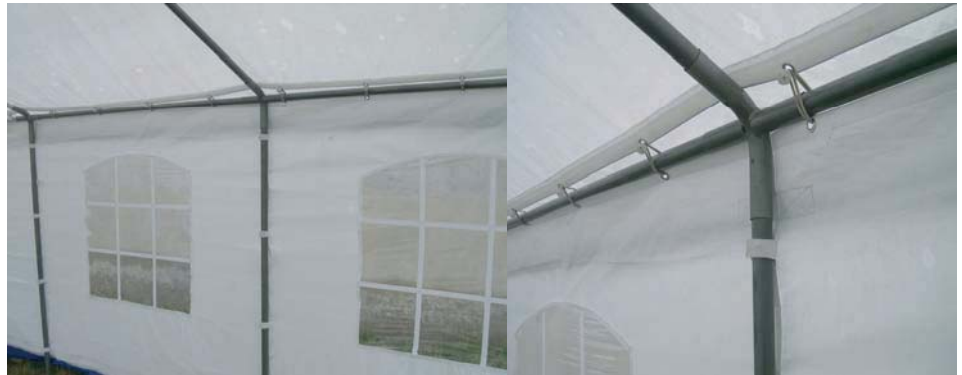
Attractive Windows & Interior