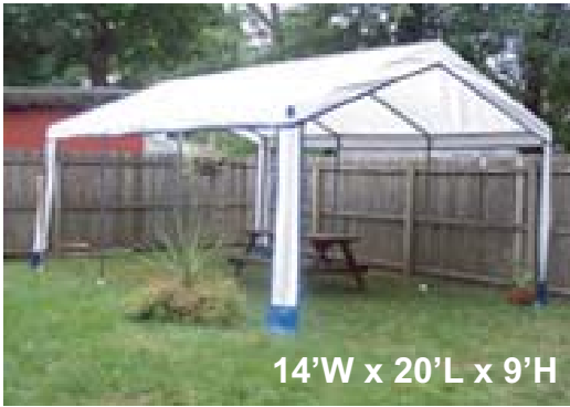
14'W x 20'L x 9'H