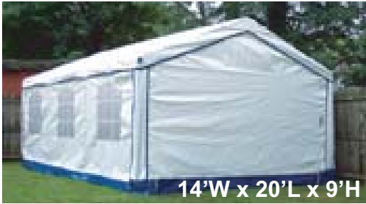
14'W x 20'L x 9'H