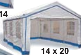
14 x 20