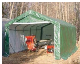
House Style Garages