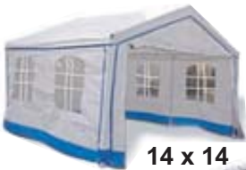
14 x 14