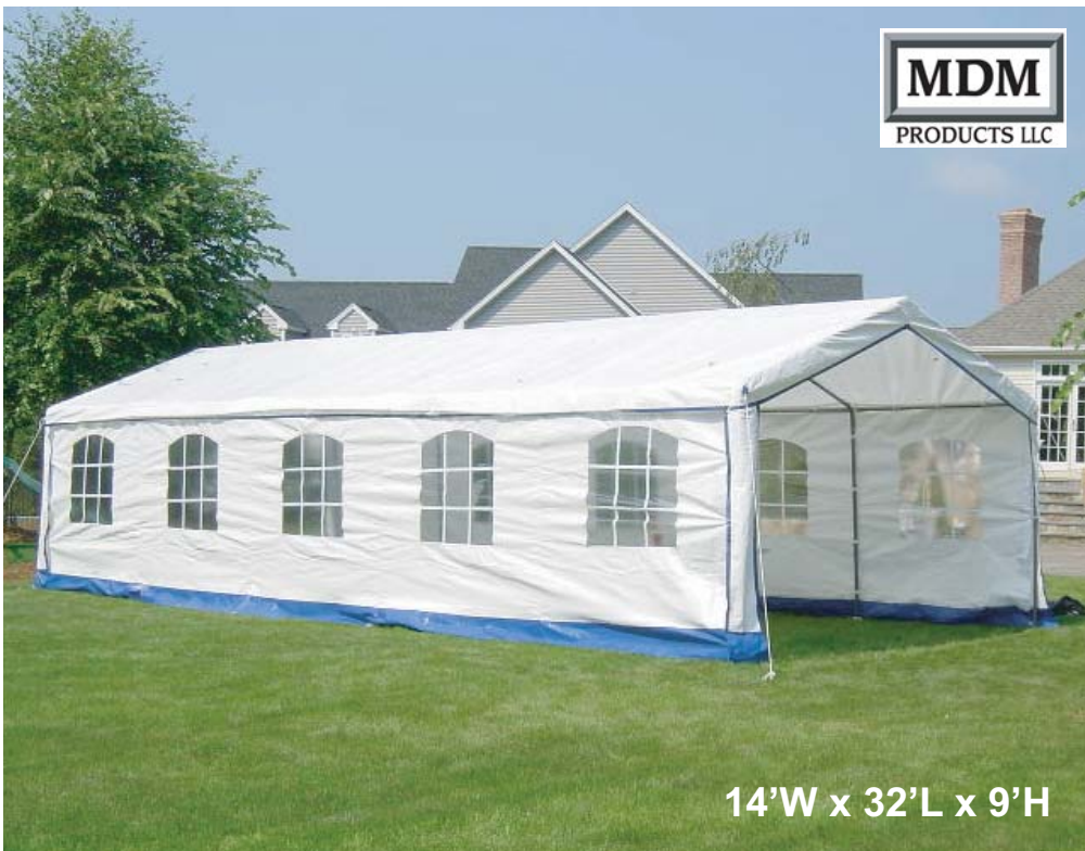
14'W x 32'L x 9'H