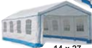
14 x 27