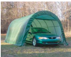
Round Style Garages