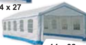
14 x 32