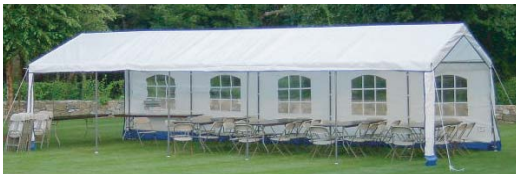
14'W x 32'L x 9'H