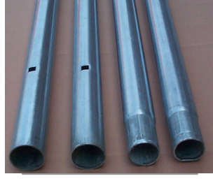
All frame members are long life Structural wind brace on each galvanized steel