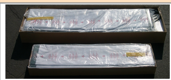
Consumer friendly packaging -Easy to handle 2 box shipment