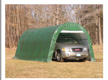
One Car Garages