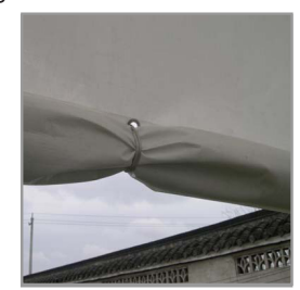
Pre-Drilled, Bolt together frame Door Hold-Up Bungee Cords